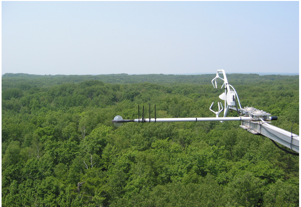
Sensors on 150-foot towers above the forest canopy measure the flow of carbon dioxide into and out of the trees at the University of Michigan Biological Station. In Great Lakes forests, carbon flow during photosynthesis and soil respiration results in the net storage of about 0.7 tons of carbon per acre each year.

Located in the heart of the Great Lakes forests, the woods of the Biological Station share a management history that is very typical of forests across Great Lakes states like Michigan, Wisconsin and Ontario, as well as Ohio. 150-foot towers measure the flow of carbon dioxide as it enters and exits above the canopy of the trees, and researchers on the ground measure everything from fallen leaves to soil carbon content to the bug population to determine the size of the carbon pool, or the overall amount of carbon present in the research area. Carbon cycle data from the research has already been used by the United States Forest Service to inform its management of national parklands, and it will become more important as international climate treaties recognize the role of forests as the primary ecosystem capable of long-term carbon storage. Because carbon dioxide is a major greenhouse gas, plants and especially trees are an important player in the effort to mitigate global warming.