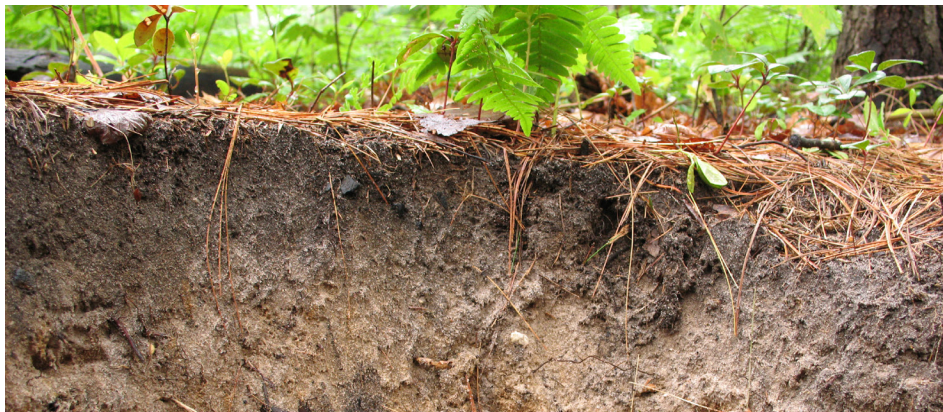
Forest soil holds the largest fraction of carbon present in the ecosystem, up to 36 tons of carbon per acre. At the same time, the decomposition of organic debris like leaf litter releases organic matter, continuing the carbon cycle and making available nutrients for additional plant growth.

as forests age, as they get to be around 100 years old, the rate of carbon storage slows dramatically and may go to zero as forests approach the old-growth stage, so that uptake and release are equal – losing carbon at the same rate as gaining carbon,” he adds. Testing this